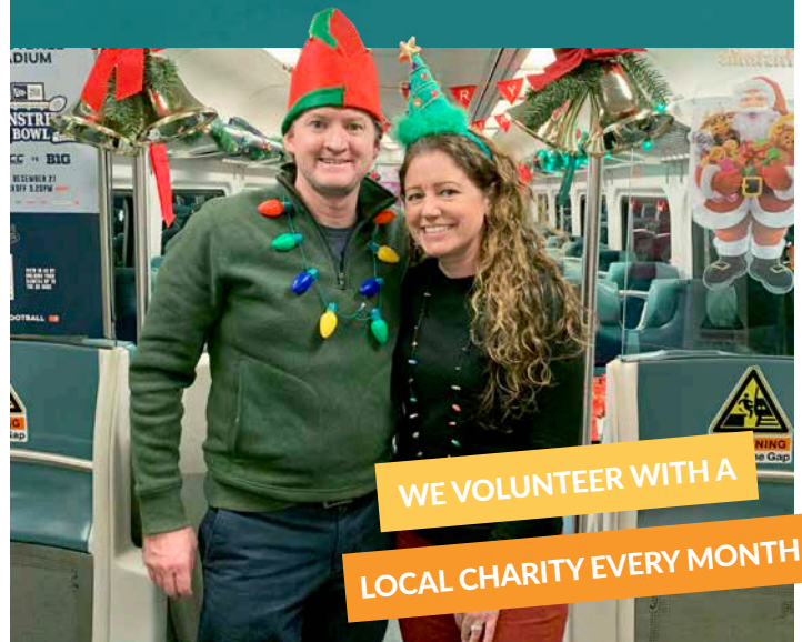
WE VOLUNTEER WITH A LOCAL CHARITY EVERY MONTH