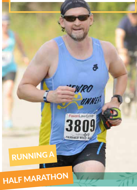
RUNNING A HALF MARATHON