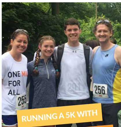
RUNNING A 5K WITH