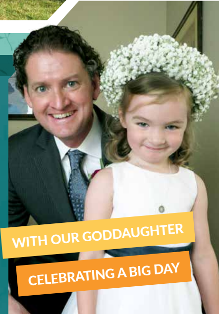
WITH OUR GODDAUGHTER

We were both raised in faith-based families and are active in our church community. Our faith has been a grounding influence in our lives, providing strength during the difficult times and acting as a guiding influence of kindness and compassion. We impart these values to our many Godchildren and hope to instill them in our own child.