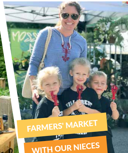
FARMERS' MARKET WITH OUR NIECES AND NEPHEW