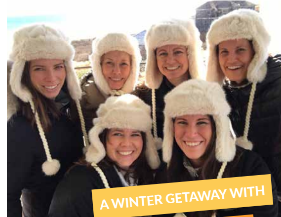
A WINTER GETAWAY WITH