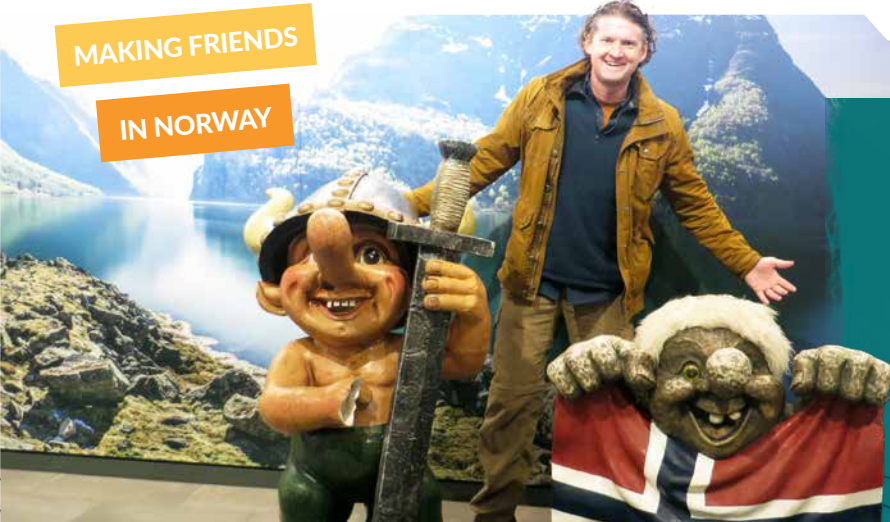
MAKING FRIENDS IN NORWAY