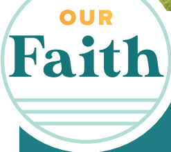
OF THE FAMILY

We were both raised in faith-based families and are active in our church community. Our faith has been a grounding influence in our lives, providing strength during the difficult times and acting as a guiding influence of kindness and compassion. We impart these values to our many Godchildren and hope to instill them in our own child.